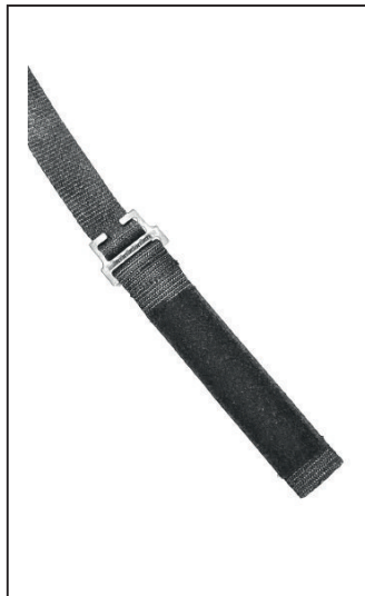
Stretch the strap.