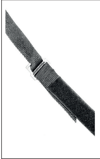
Insert the strap to the left side.